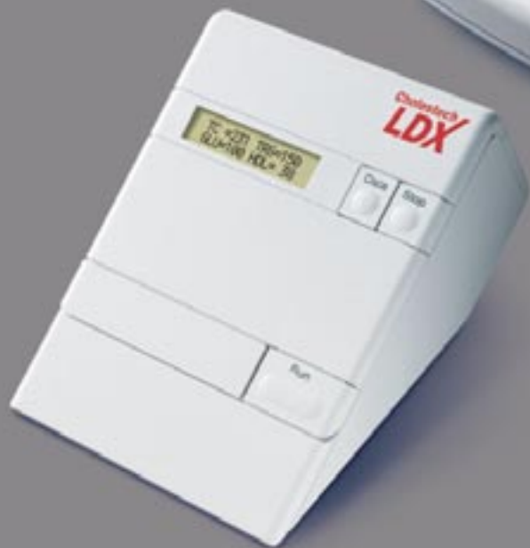
Full Lipid Profile or ALT in 5 Minutes