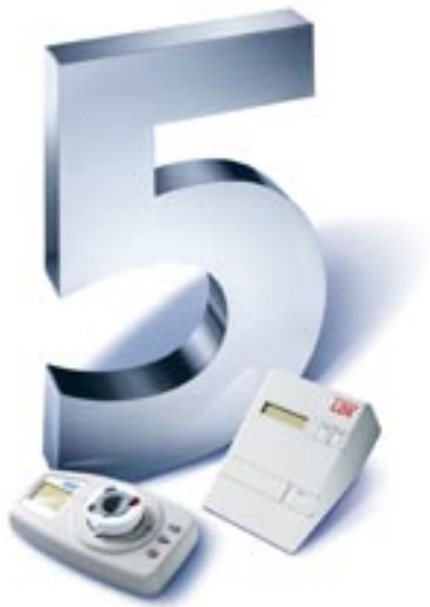
Results in 5 minutes.