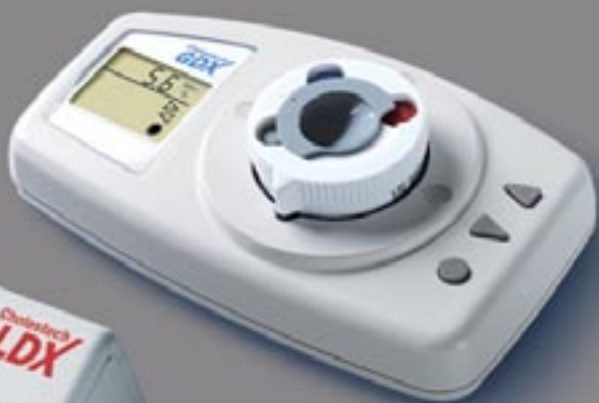
A1C in 5 Minutes